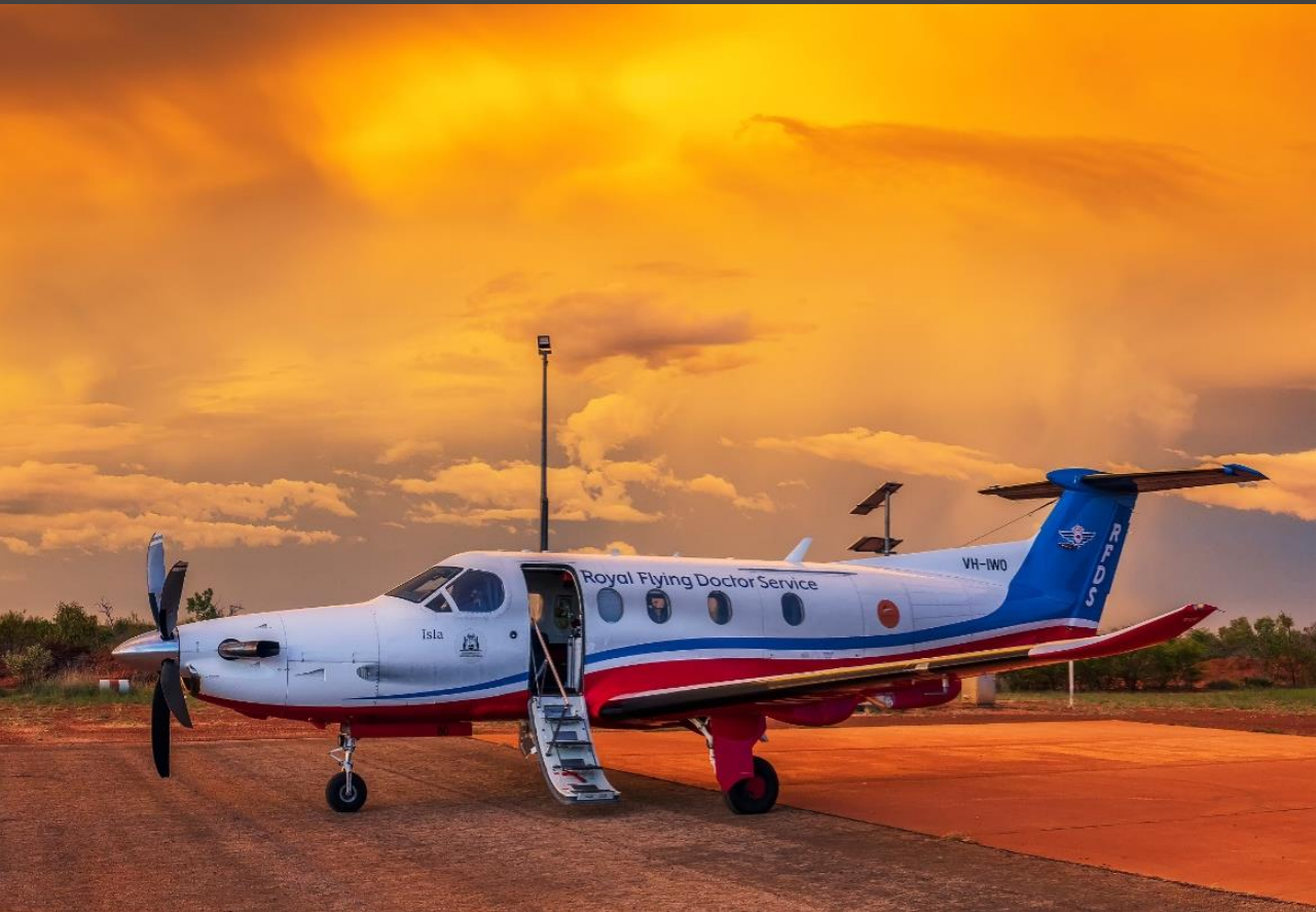
The PC-12 turboprop