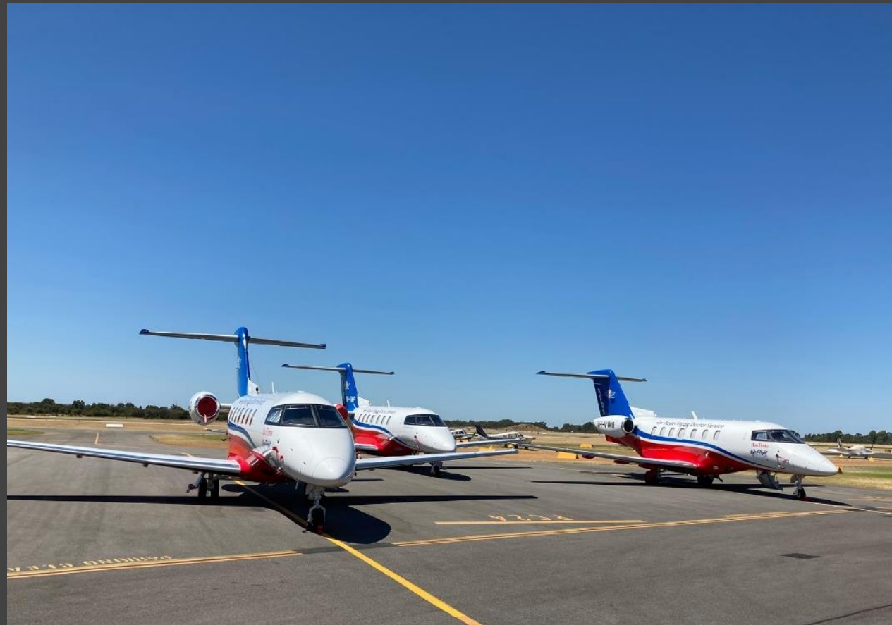
Rio Tinto LifeFlight PC-24 jets