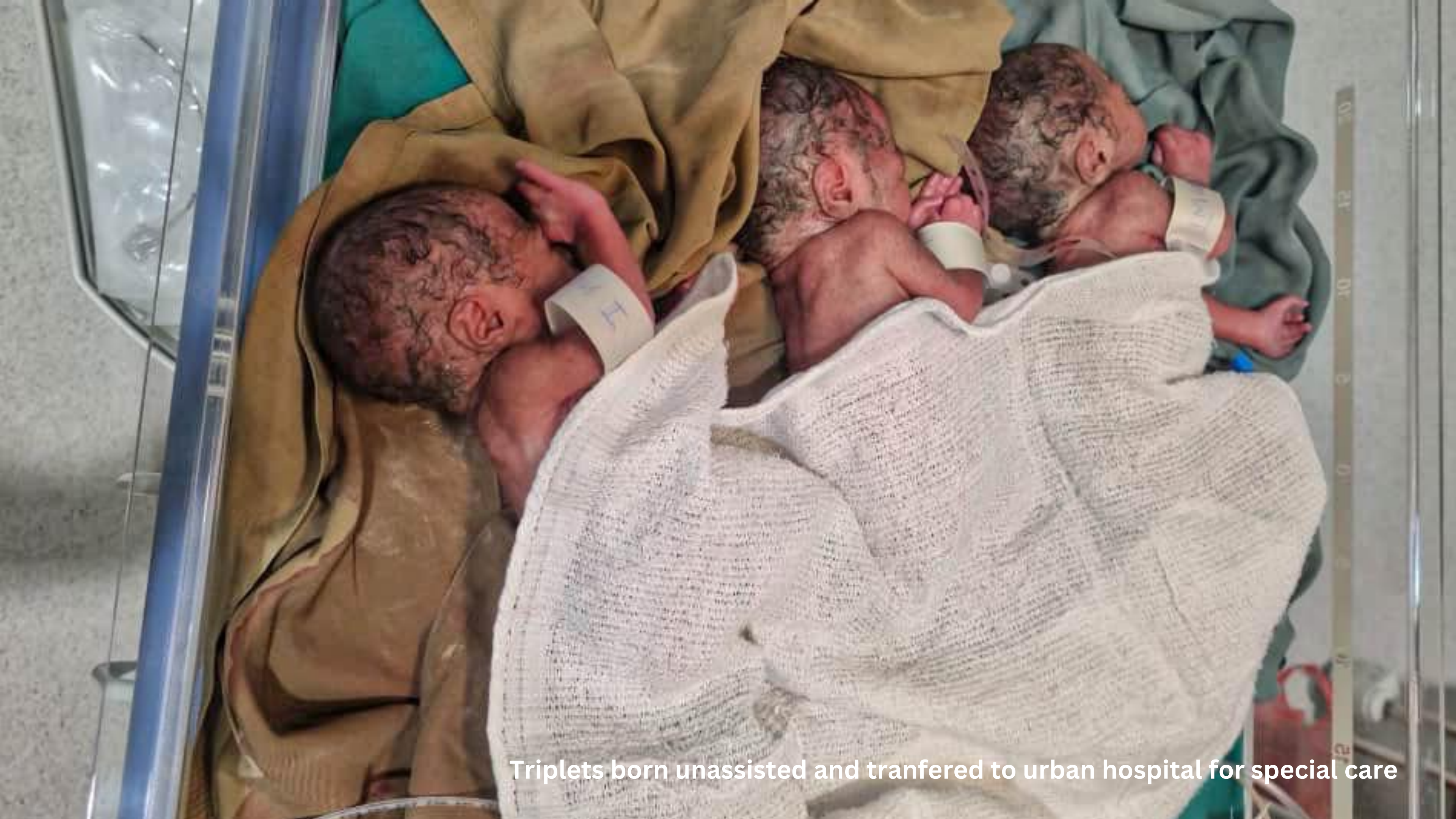
Triplets born unassisted and tranfered to urban hospital for special care