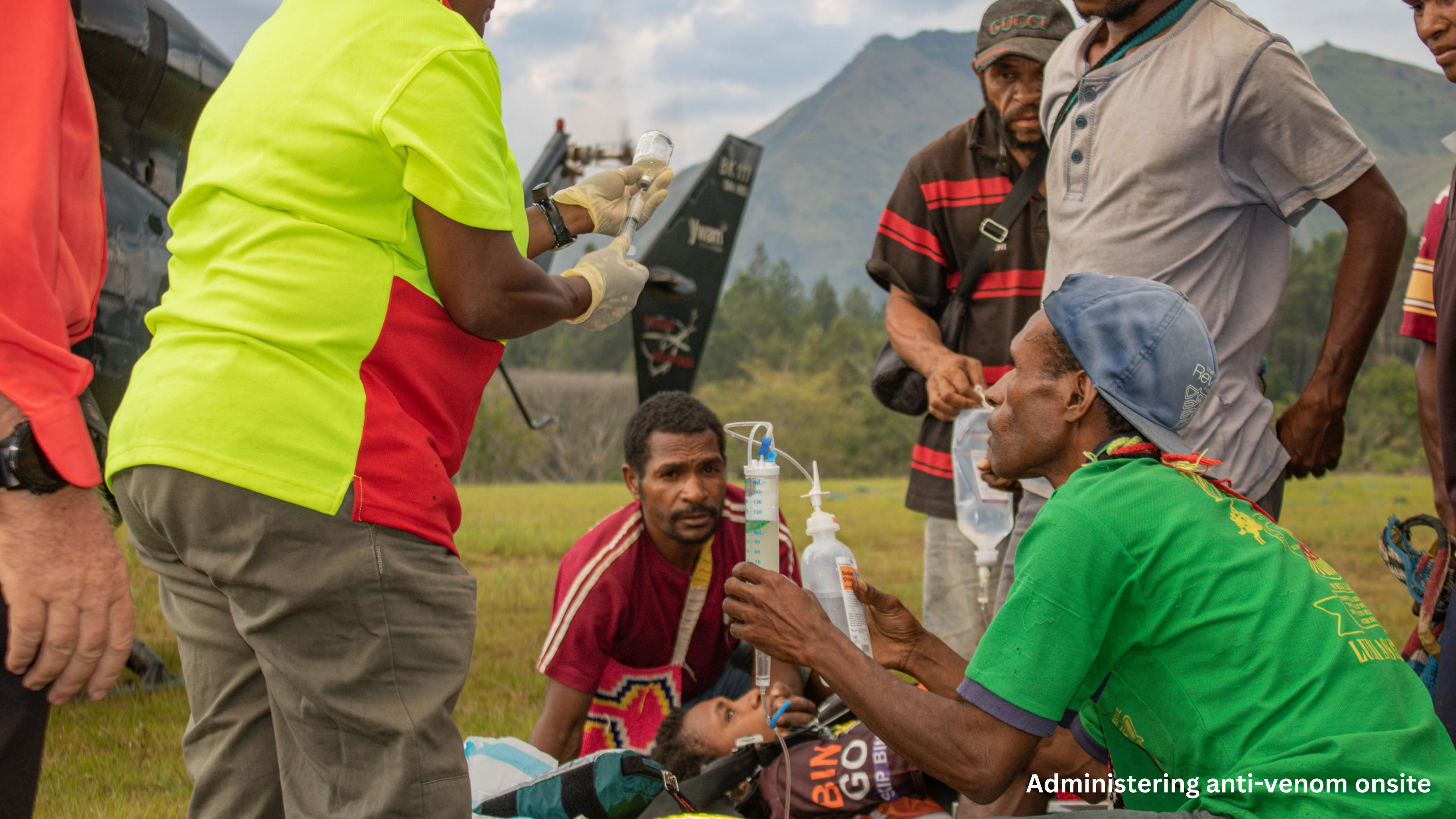
Administering anti-venom onsite