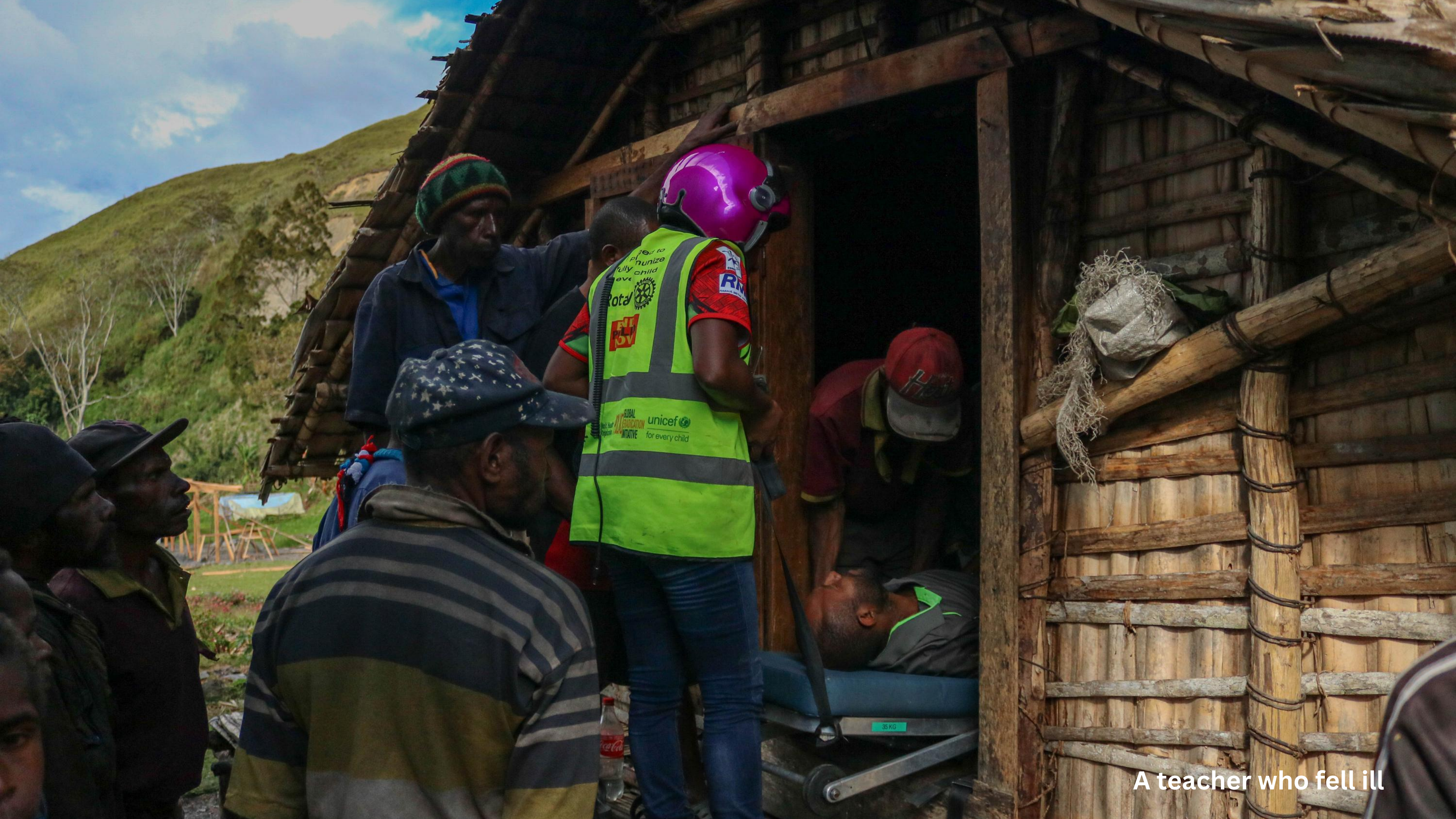
A teacher who fell ill